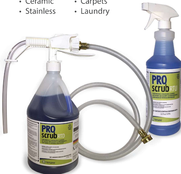
PROscrub RTU - LPS101K Ready-to-Use Solution Case of 12x 32oz/1L bottles